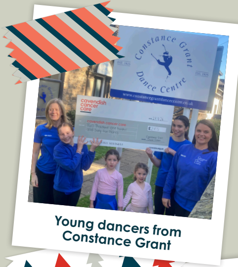
Young dancers from Constance Grant

Once again our incredible supporters have gone the extra mile to raise money for us this year. We receive a tiny amount of government funding and without our supporters we simply wouldn't be able to keep our doors open. This year our fabulous fundraisers have walked, run, jumped off buildings, climbed mountains, danced, written books, done spin classes, played golf, hosted parties, undertaken ultra-marathons and so much more, all so that we can keep on doing what we do best! There are so many amazing people to mention, and we just don't have the space to thank everyone however we are so grateful to everyone who gives up their time and money to fundraise for us.