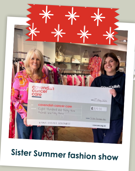
Sister Summer fashion show