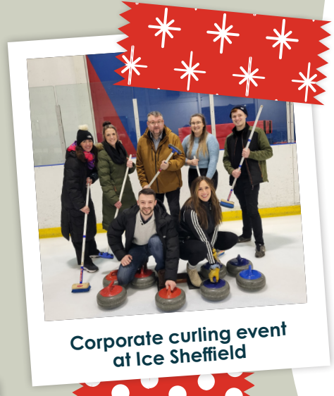
Corporate curling event at Ice Sheffield