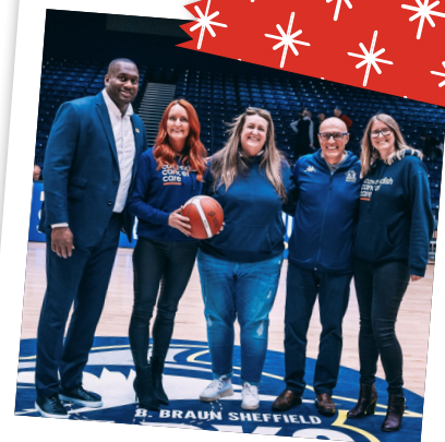
With our friends at Sheffield Sharks