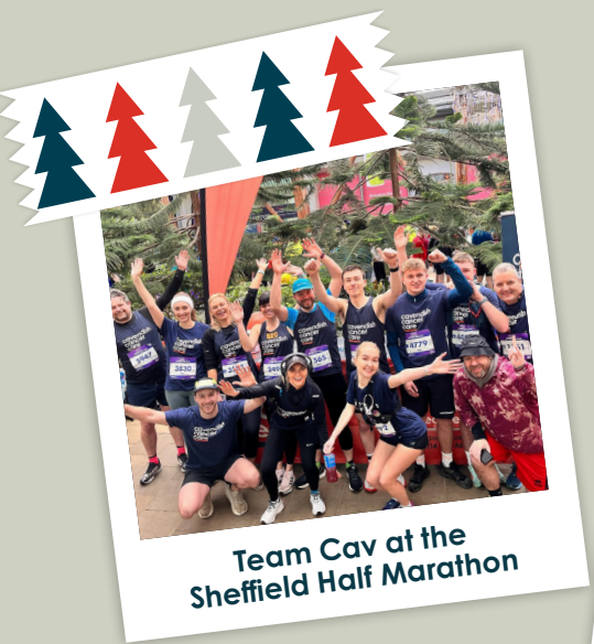
Team Cav at the Sheffield Half Marathon