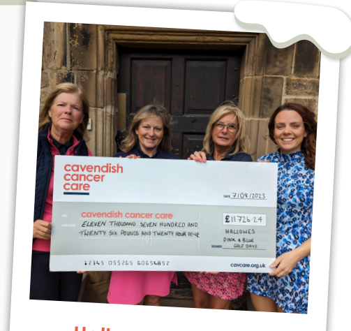
Hallowes Golf Club

Ambulo Café have run a coffee morning on the last Friday of every month, with the price of each hot drink bought coming to us as a donation, raising £1468.