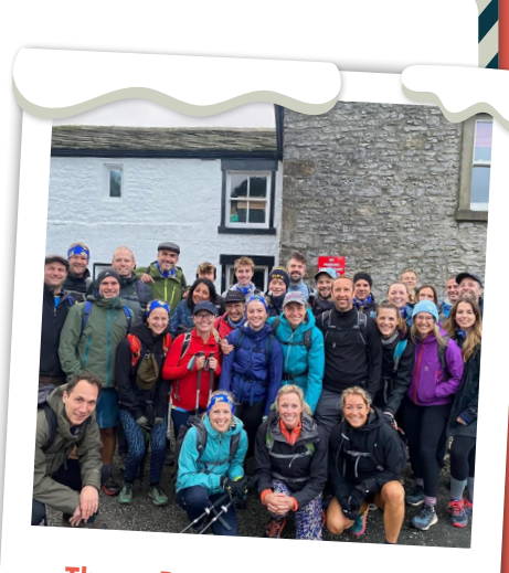
Three Peaks Challenge!