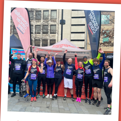
Sheffield Half Marathon

Once again our supporters have put the 'fun' into fundraising by raising money for us this year in a host of creative ways. We receive a tiny amount of government funding and so without our supporters we simply wouldn't be able to keep our doors open. We really do rely on people running sponsored events, challenges and the generous support of local businesses and individual donors to keep going. There are so many amazing people to mention, and we don't have room to thank everyone, however we are so grateful to everyone who supports us.